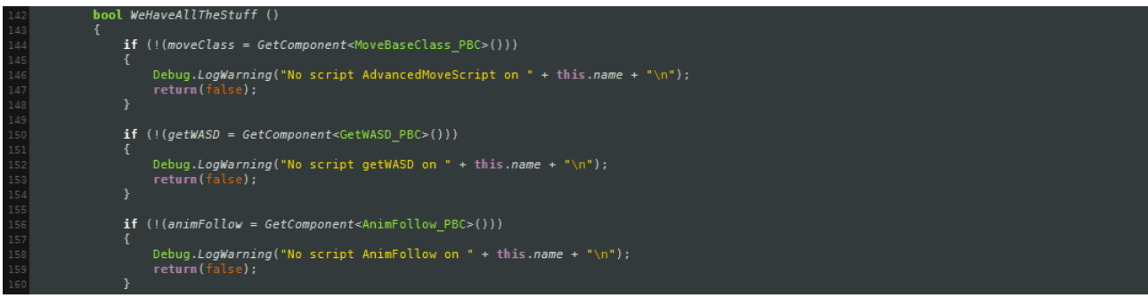
Illustration 5: The method WeHaveAllTheStuff tries to help the user find setup errors.

In several scripts you will see a bool called userNeedsToFixStuff that is set by a method called WeHaveAllTheStuff. The WeHaveAllTheStuff method assigns the variables that needs assigning and checks that the other dependencies are ready. This is a helper function to give the user tips and warnings about things that may cause the package to not execute properly. With the advent of the automatic set-up the need for these checks are greatly diminished, but for the time being they persist. This does not affect performance but can, if you want to, be removed (lines that do assigning must persist). WeHaveAllTheStuff consists mostly of things like the code shown in Illustration 5.