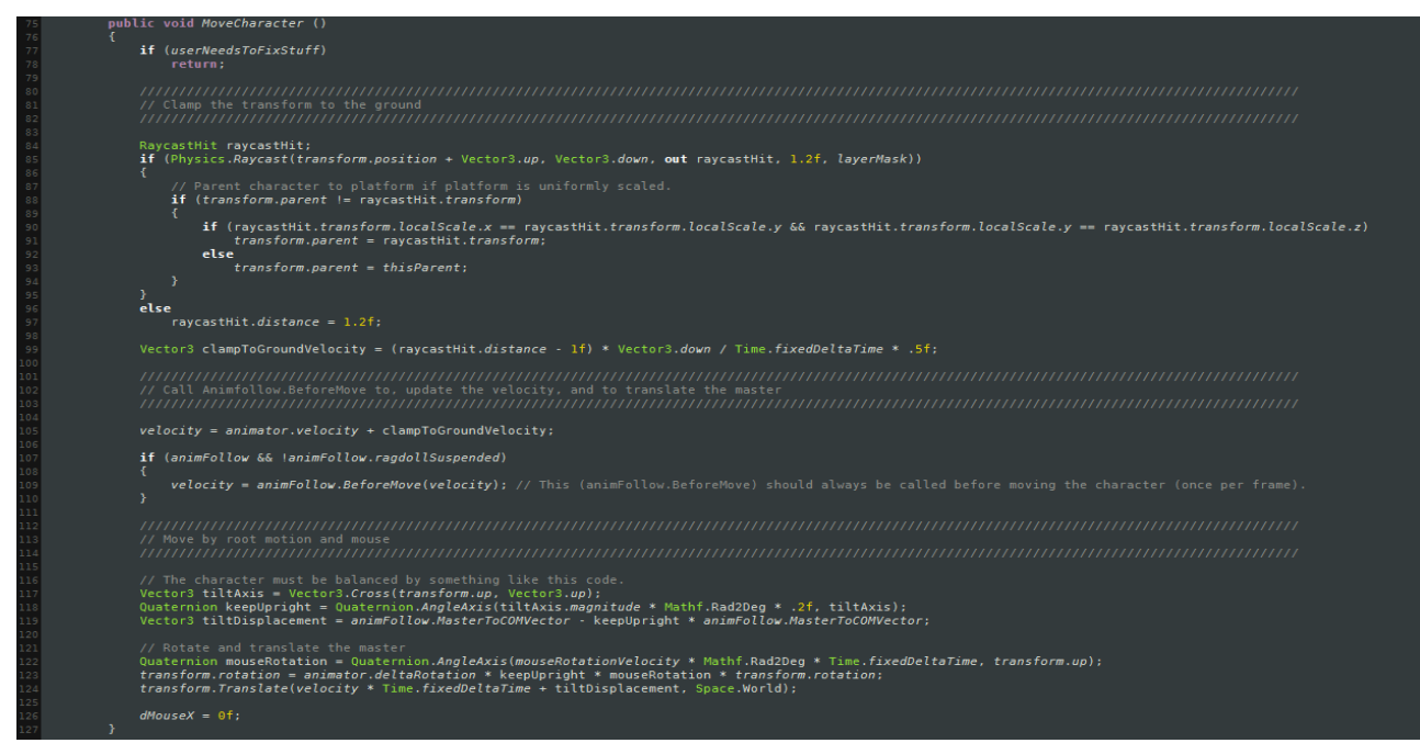
Illustration 4: The simple MoveScripts is an example of the minimum of things that must happen to have any kind of working system.

This asset is complicated. Many things must happen in sync to get the desired result. As a service to anyone feeling overwhelmed I provide a BasicOnly character with a simple MoveScript, Illustration 4, that is an example of what must happen to have any kind of working system. Maybe you don't need all the bells and whistles of a full PBC character, or you enjoy building your own code. This may be the place to start for you.