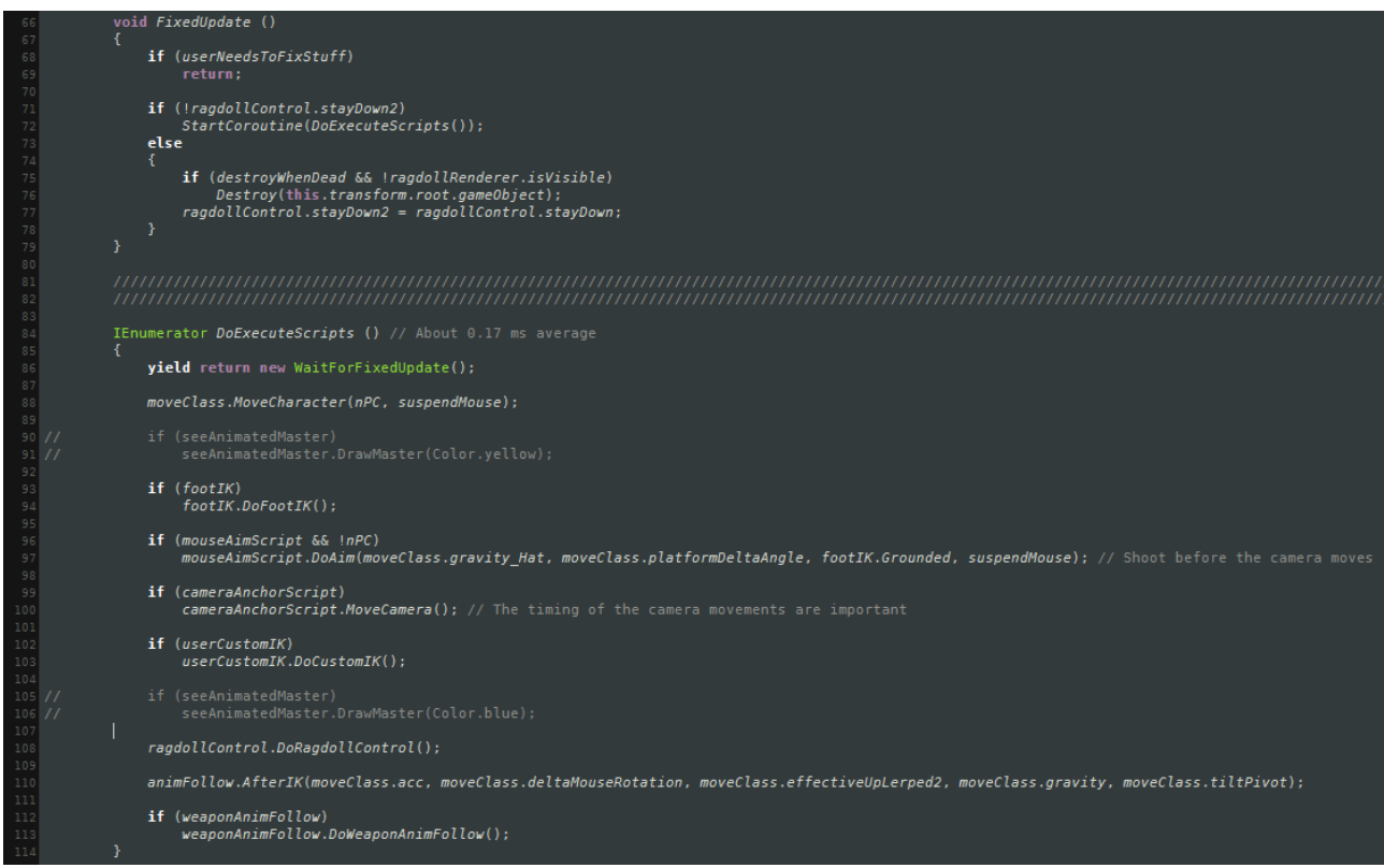
Illustration 3: The Main script, determines the execution order.

The commented out lines, in Main, that says SeeAnimatedMaster. DrawMaster can be uncommented to let you see a stick figure of the master at that point in the execution. This allows you to simultaneously see what the master's and the ragdoll's poses are. Under normal operation only the ragdoll is shown. There is also an option in the script AnimFollow to instead see only the master. These options are off course there as debugging tools if the character exhibits unexpected behavior.